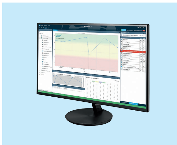
Network management software PROmanage® NT